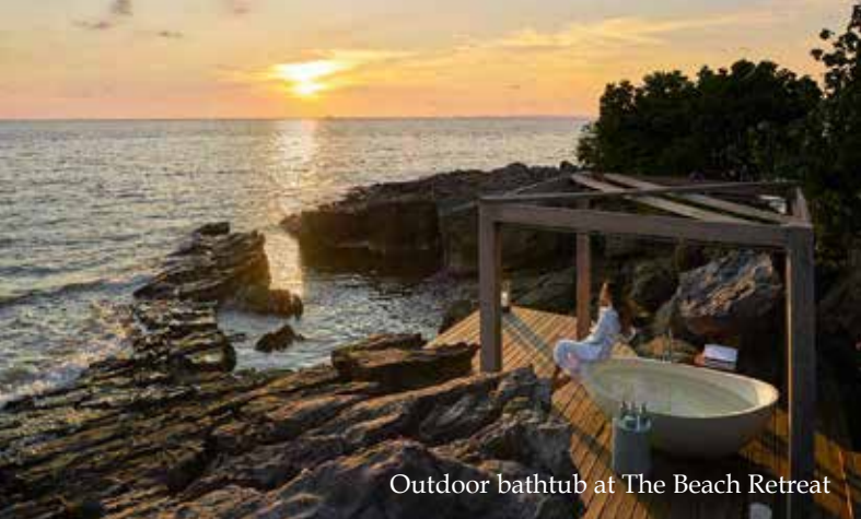
Outdoor bathtub at The Beach Retreat