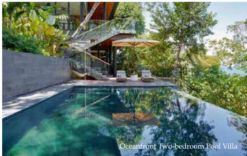
Oceanfront Two-bedroom Pool Villa