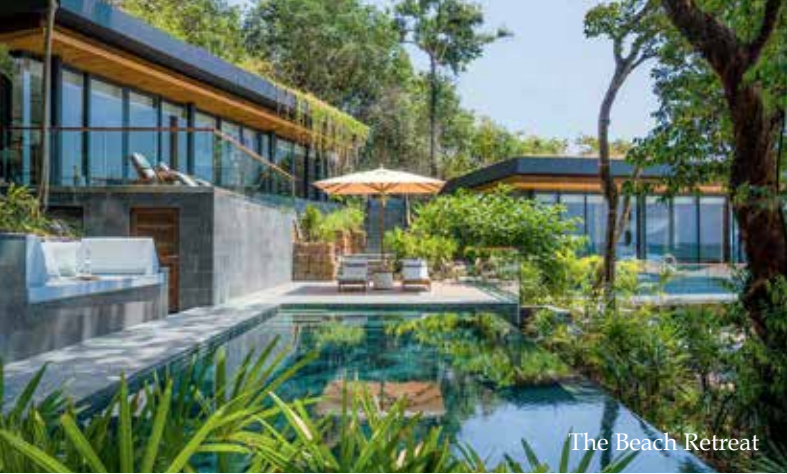
The Beach Retreat