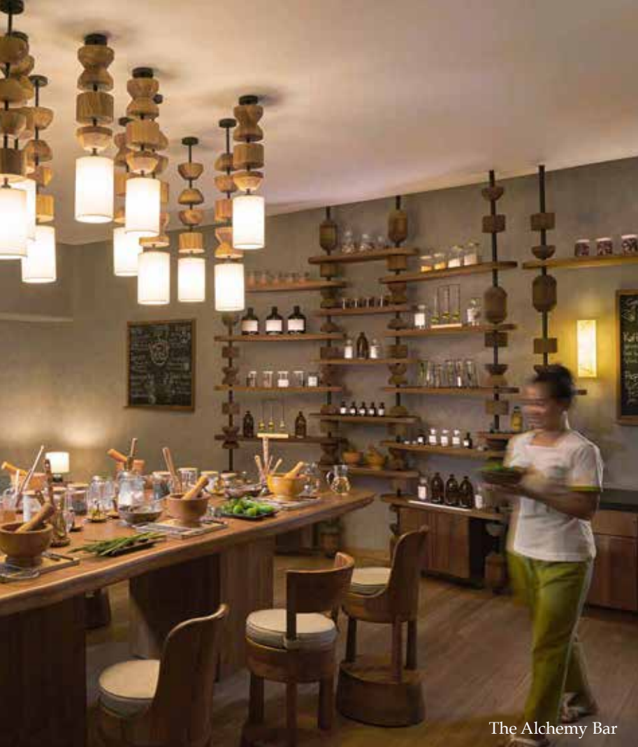
The Alchemy Bar