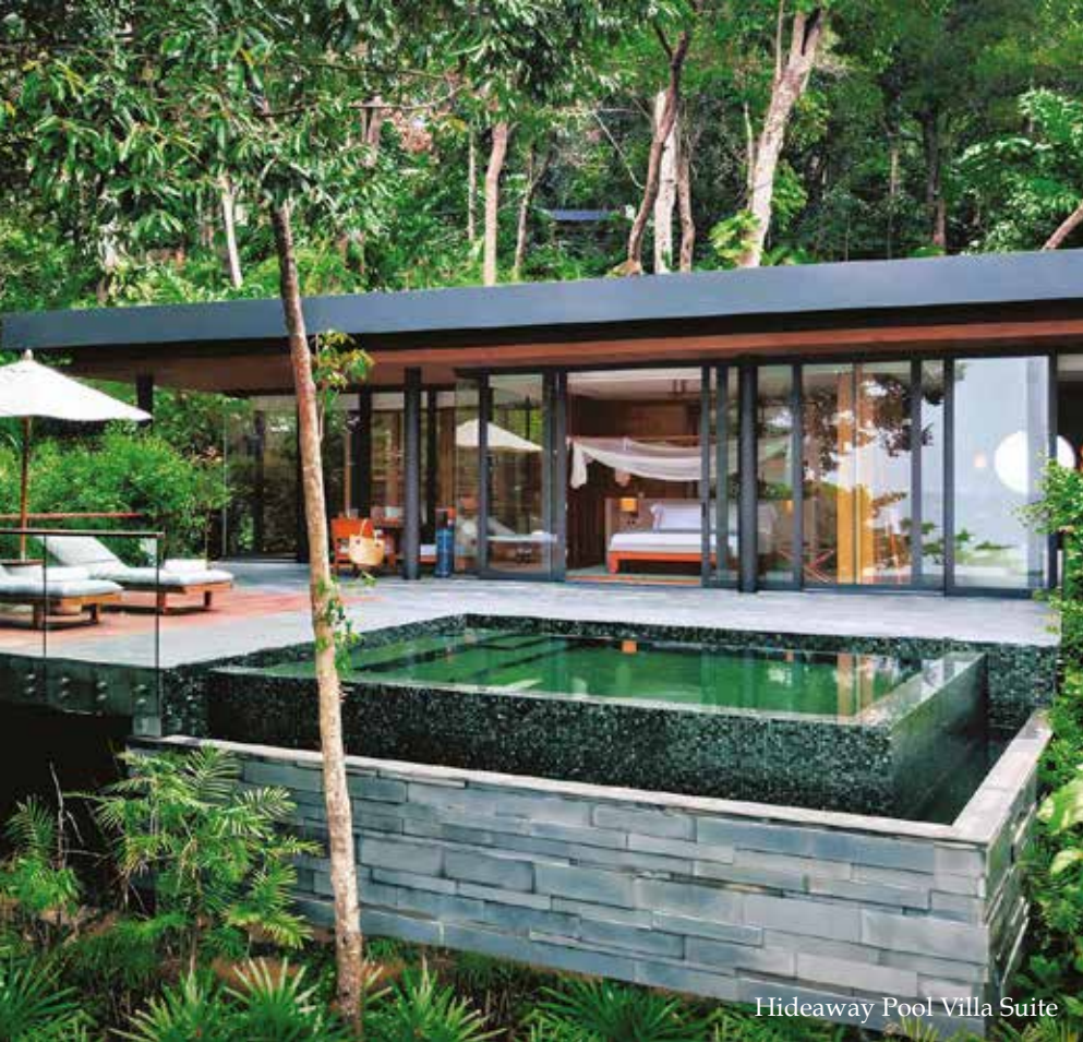
Hideaway Pool Villa Suite