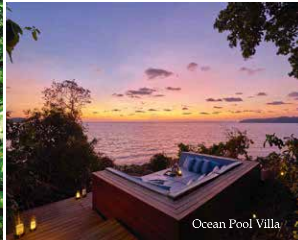
Ocean Pool Villa