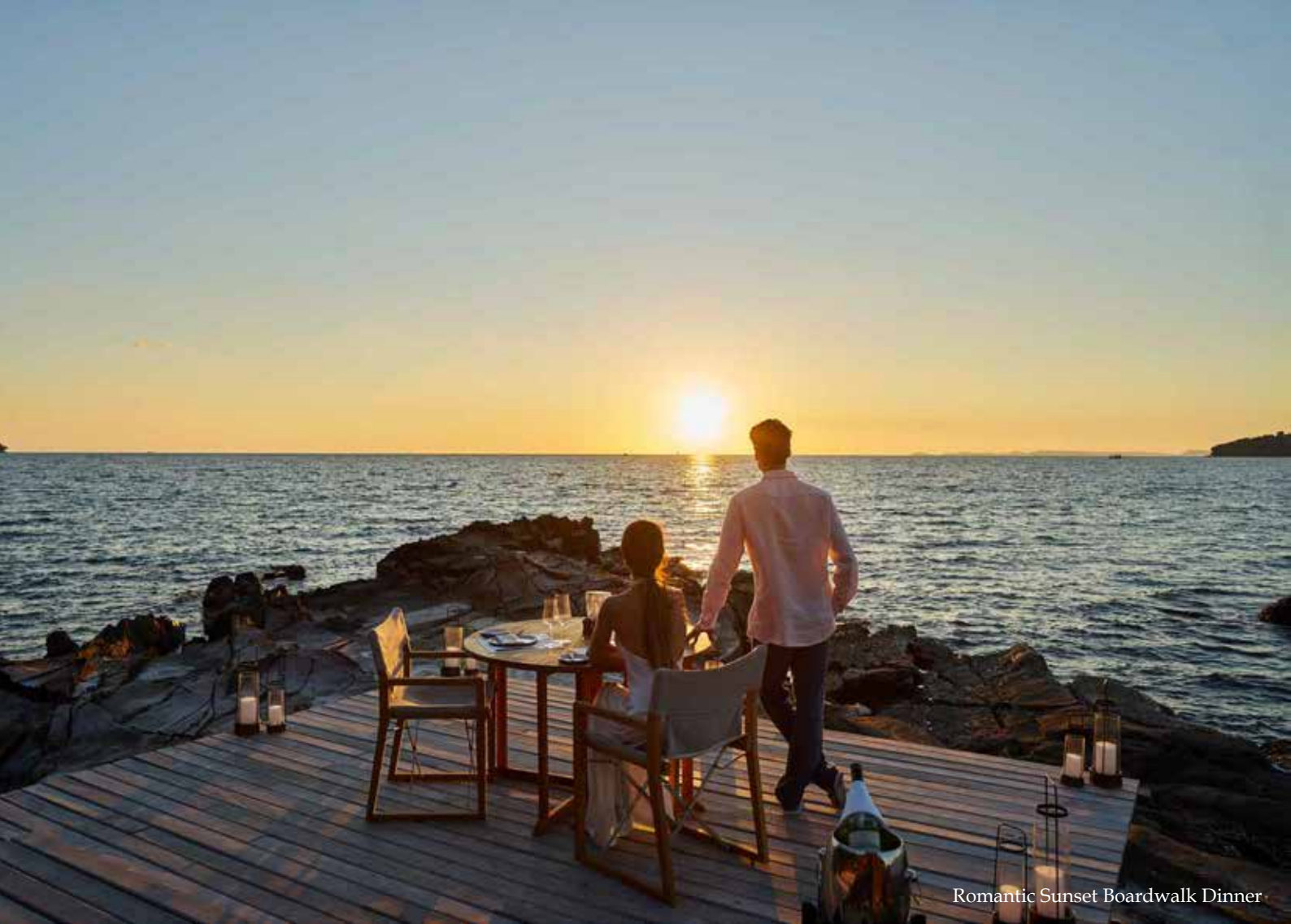
Romantic Sunset Boardwalk Dinner