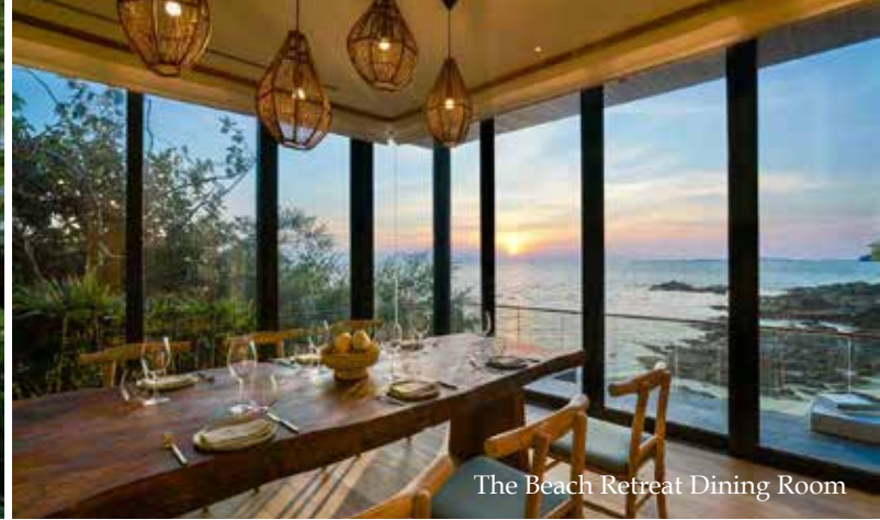
The Beach Retreat Dining Room