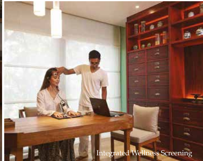
Integrated Wellness Screening