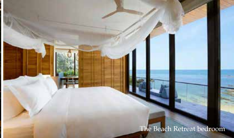
The Beach Retreat bedroom