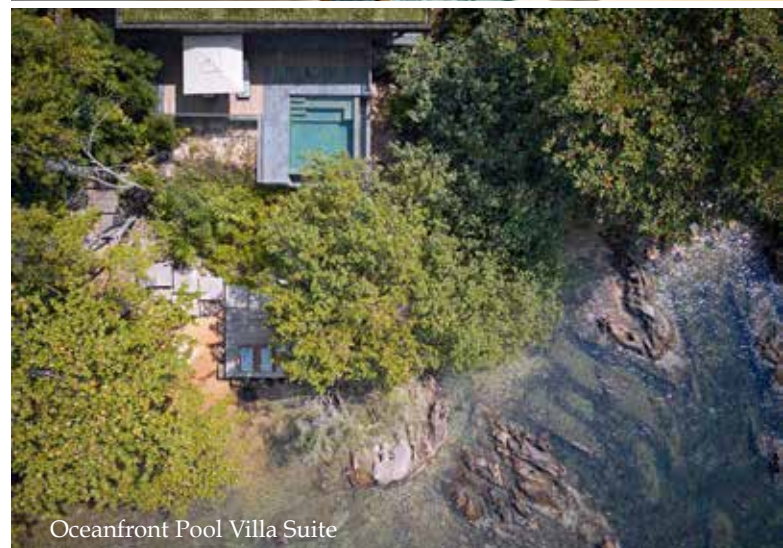
Oceanfront Pool Villa Suite