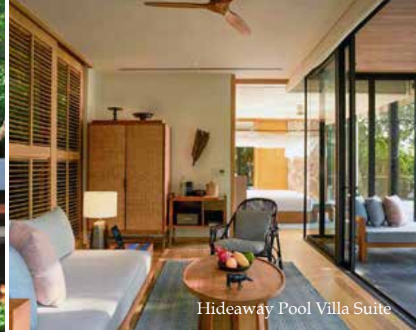
Hideaway Pool Villa Suite